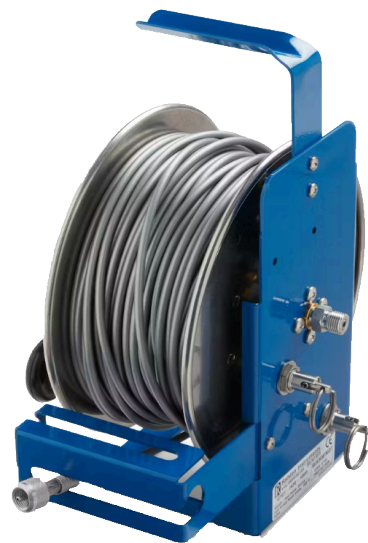
Manuf. Model QTHR-0000