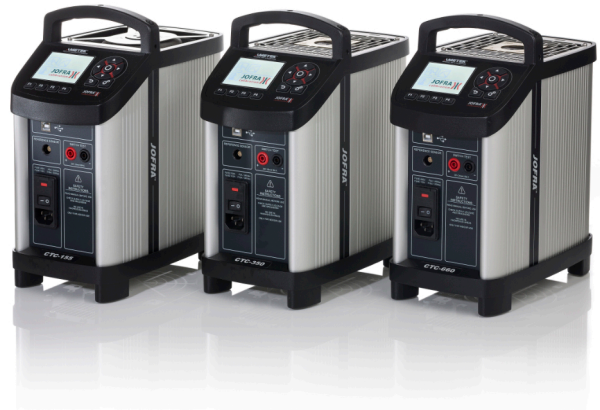
Manuf. Model Various SKUs