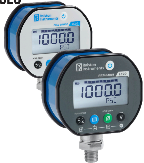
Manuf. Model LC10 / LC20