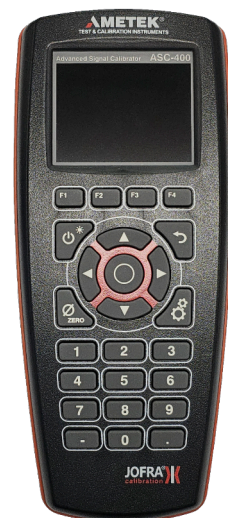
Manuf. Model ASC-400